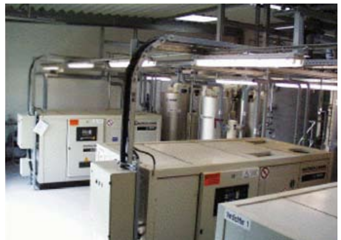
Generation of compressed air, Bitterfeld, Germany