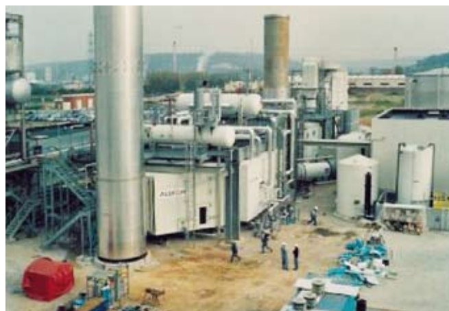
Combined cycle power plant, Port Jérôme, France