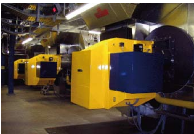
Flame tube boiler plant, Goslar, Germany