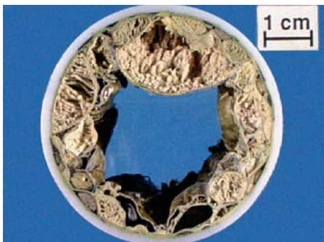
Delamination in PTFE Liner Tube

After the root cause of a failure has been determined we provide economical resolutions in order to avoid reoccurrence of the failure mode. Our hands-on failure repair and avoidance strategies cover other fields beyond materials technology. The Bayer Technology Services approach targets a high benefit to cost ratio, covering all components of a piece of equipment, and relates to a materials technology evaluation of the whole unit or plant.