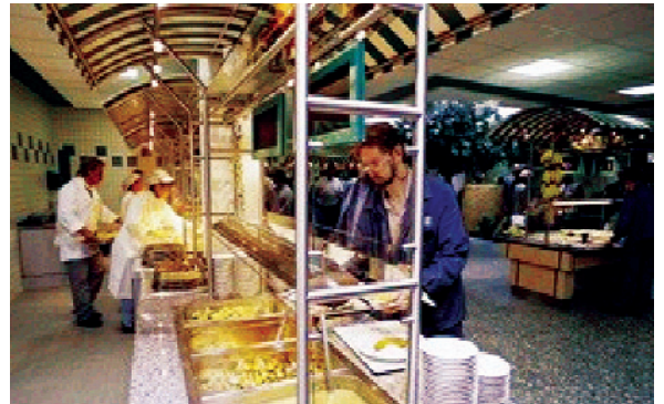
Restaurant in Uerdingen

We also offer maintenance services after the building is complete.