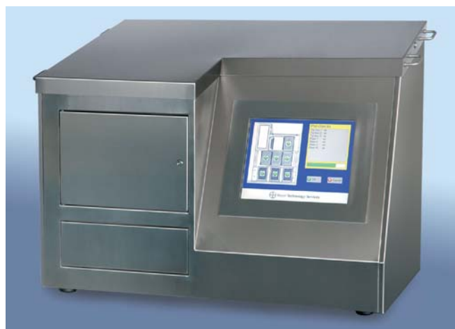
The MultiBioAnalyzer by Bayer Technology Services