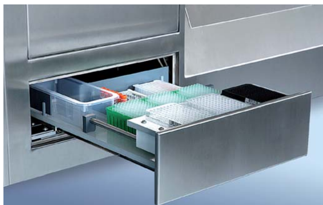
Drawer for easy loading of samples and assay consumables